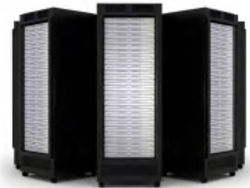
SERVER DATA CENTER